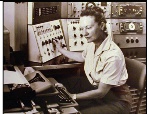
National Bureau of Standards Electronic Automatic Computer (SEAC)

These two options offer the project and the Alliance a wide range of technical and resource support options. The Google vs. OCA issue is one that is hotly debated in academia right now ( http://www.freepress.net/news/27239 ), so we eagerly await the task force's recommendations!